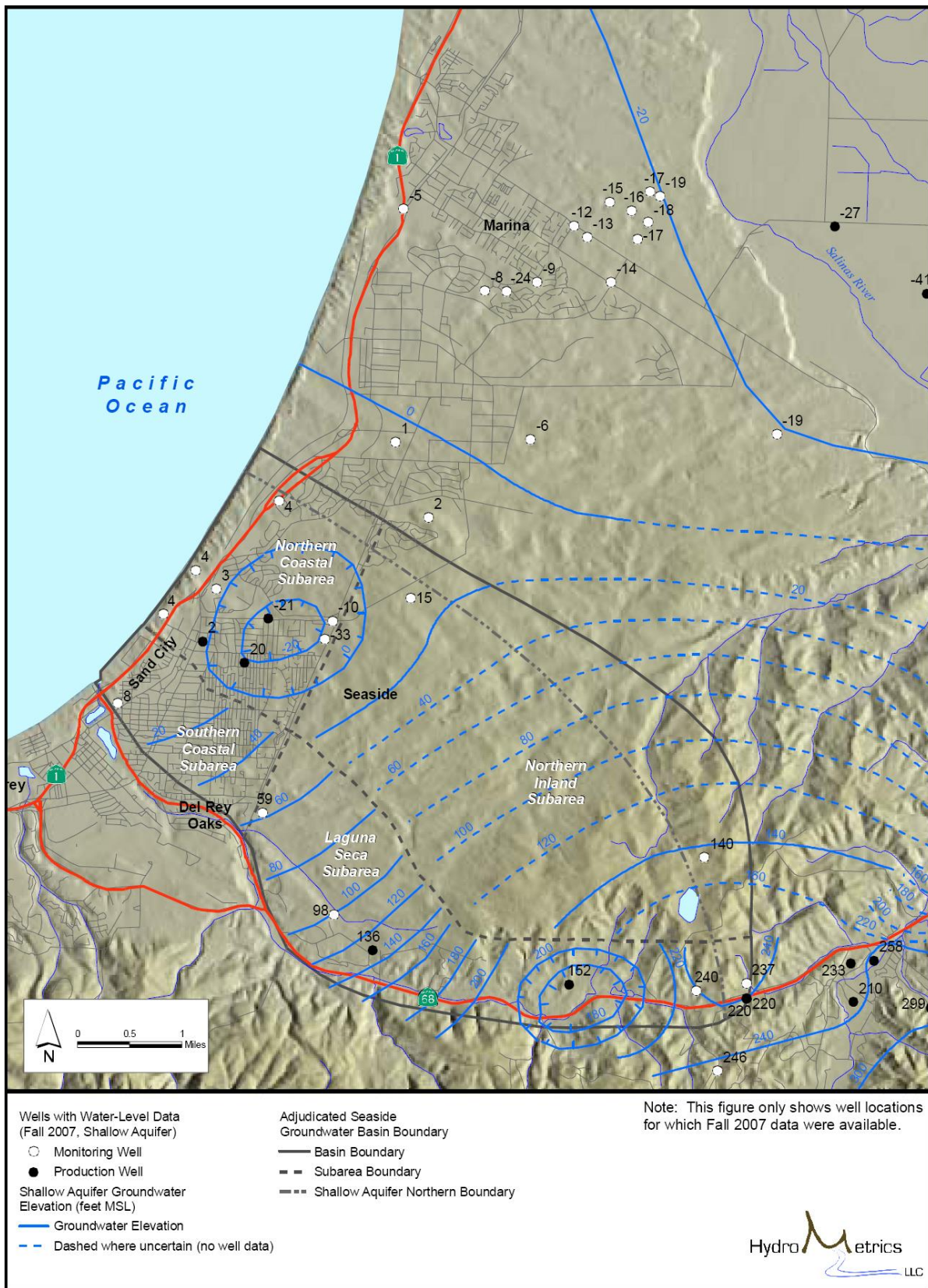
Figure 5: Groundwater Elevation Contours in the Shallow Aquifer (Correlated to the 400-Foot Aquifer in Salinas Valley) – Fall 2007